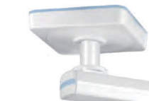
Long base, height: 400mm