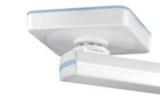
Short base, height: 200mm