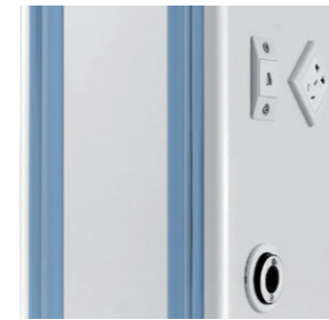
Built-in rails, more hygienic