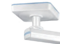
Long base, height: 400mm