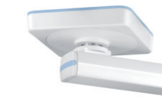
Short base, height: 200mm