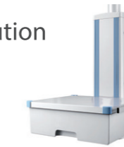
Distribution column height: 800mm, 1000mm