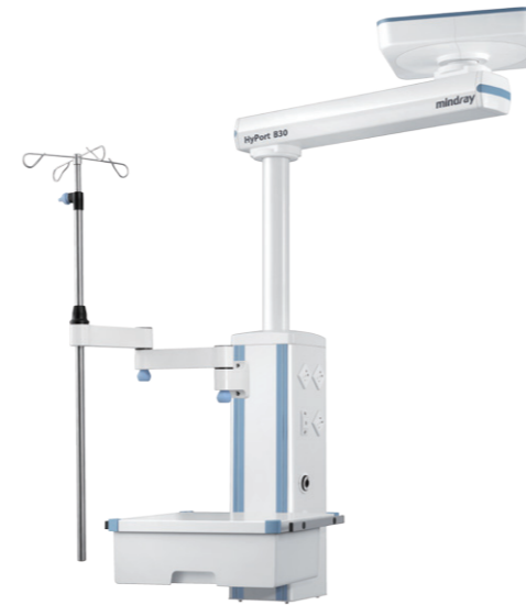
Anesthesia Pendant with single arm, column version