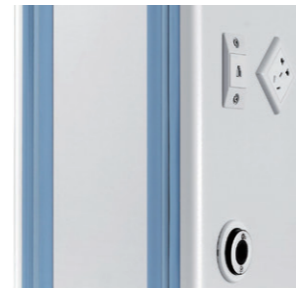
Built-in rails, more hygienic