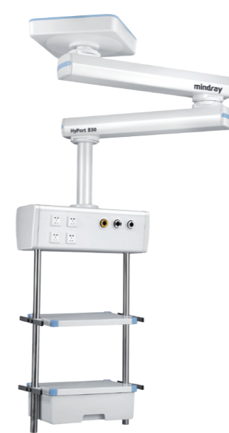
Surgical Pendant with double arms, head version