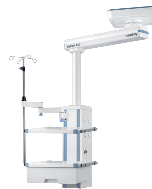
ICU Pendant with single arm, column version