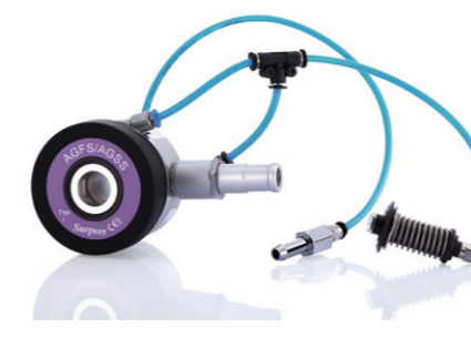
More options for gas outlets