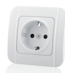
More options for electric outlets