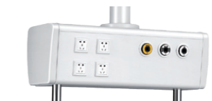
Distribution head length: 680mm, 780mm